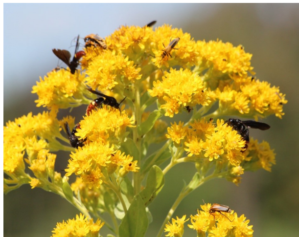
Stiff goldenrod - a pollinator winner

A top winner in the Bees, Bugs, Blooms trial, Solidago rigida came in second for total pollinator visits and first for attracting the most diversity of pollinators. It grows 2 to 5 ft. tall on stiff stems that keep it erect in the garden. It likes moist to average soil but can tolerate drought and is great for back of the border.