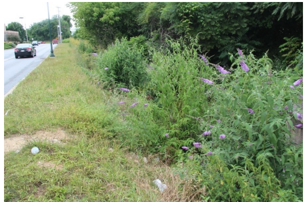
Butterfly bush along a road in York County

Another compelling argument for not planting butterfly bush is that by choosing it instead of a plant that helps support the insect and caterpillar population, you are not helping the food web. To survive, butterflies desperately need host plants with leaves that are palatable to their offspring, young caterpillars.