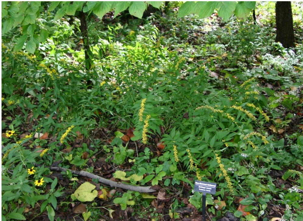
Solidago caesia —wreath goldenrod at woods edge with blue wood aster and Rudbeckia fulgida

This shade tolerant goldenrod tolerates medium shade to partial sun. In nature it is found in open woods and along woodland edges. Growing 2 to 4 feet tall, it looks great in dappled shade in the garden.