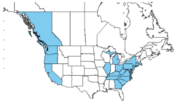
USDA Map showing states where Buddleia is invasive

In our own 0.4 acre, we want to pack in as many beneficial plants as possible. So instead of butterfly bush we have chosen important host plants such as oak trees, pawpaws, spice-bush, milkweeds, asters, goldenrods and others. These plants are not only host plants, but also provide the nectar that adult butterflies need.