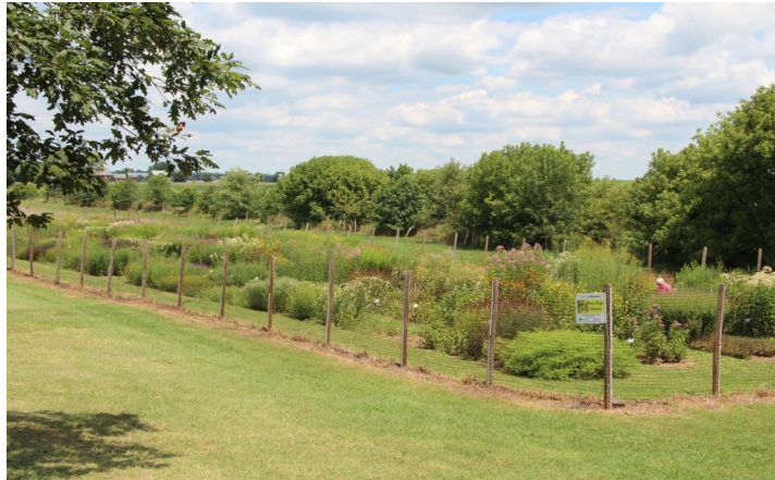
Pollinator Trial at Penn State's Research Center near Manheim

Each issue we will highlight plants from our trial at the Southeast Research and Extension Center — Bees, Bugs, & Blooms. From 2012 to 2014, 84 plants and some of their cultivars were monitored for their attractiveness to a wide variety of pollinators. The results are on our Pollinator Friendly Garden Certification website. Go to http://ento.psu.edu/pollinators/public-outreach/cert and click on Step 1 – Provide Food. On that page you will find a list of links. The first one, Bees, Bugs Blooms, contains our results. Check it out!